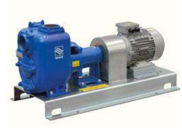
JE...ST PUMPS Base plate