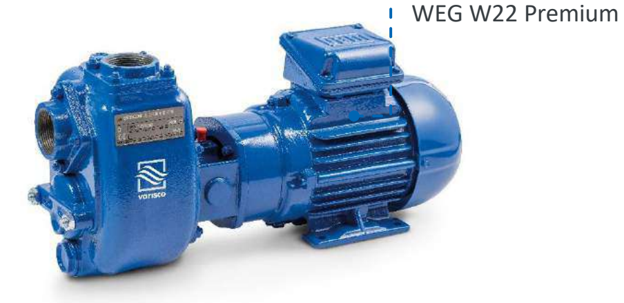
JE...NT PUMPS Standard electric motor (small sizes available from June 2021)