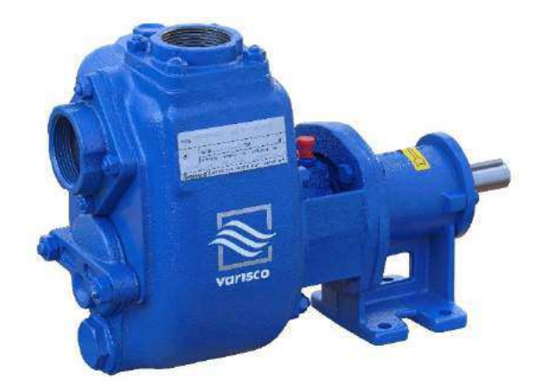
JS PUMPS Bare shaft