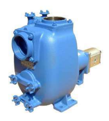
JO PUMPS Hydraulic motor